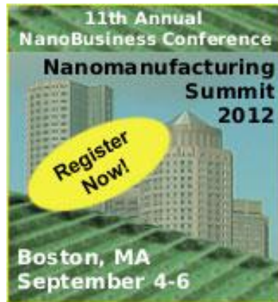
US Summit (2012)